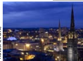
Left to right: Godiva statue, Coventry skyline, Whittle Arches and Millennium Place